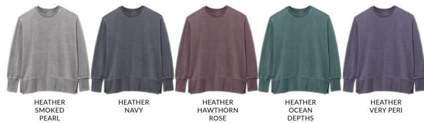
HEATHER SMOKED PEARL

57% Cotton / 43% Polyester, 220gsm/8oz. A must-feel, luxurious finish. Lightweight, breathable fleece, cloud like softness, brushed interior and a burnout process to give it a vintage feel. Oversized for ultimate comfort. Available in S-XXL.