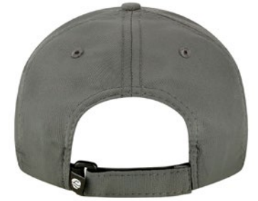
MICRO VELCRO CLOSURE WITH STRETCH LOOP