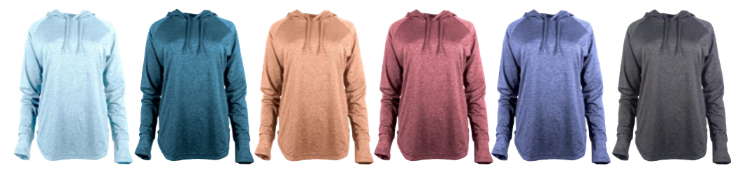
NEW QUIET TIDE HEATHER NEW OCEAN DEPTHS HEATHER MUTED CLAY HEATHER HAWTHORN ROSE HEATHER PERIWINKLE HEATHER CHARCOAL HEATHER

Athletic trim with a cozy, oversized hood. Advanced moisture management fabric technology wicks perspiration from the skin. Designed to perform in all weather conditions. Sun protection of UPF 30+. Raglan sleeves for ultimate range of motion. Longer back for an athletic and comfortable fit. Thumbholes at sleeves for added comfort & warmth. Available in S-XXL.