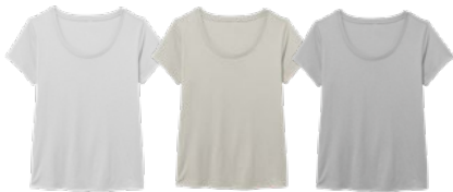
WHITE CLASSIC OATMEAL STEEL GREY

50% Cotton / 50% Polyester, 140gsm/4.8oz. Classic Oatmeal is 99/1, 150gsm/4.8oz. Soft to the touch, hangs nicely without clinging. Pre-shrunk cotton helps preserve fit. Available in S-XXL.