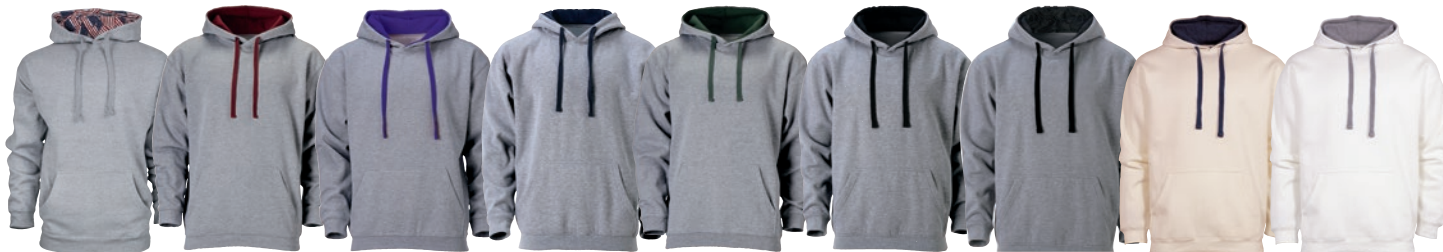
PREMIUM HEATHER/FLAG PREMIUM HEATHER/MAROON PREMIUM HEATHER/PURPLE PREMIUM HEATHER/NAVY PREMIUM HEATHER/ATHLETIC HUNTER PREMIUM HEATHER/BLACK PREMIUM HEATHER/TOPO VINTAGE WHITE/NAVY WHITE/PREMIUM HEATHER