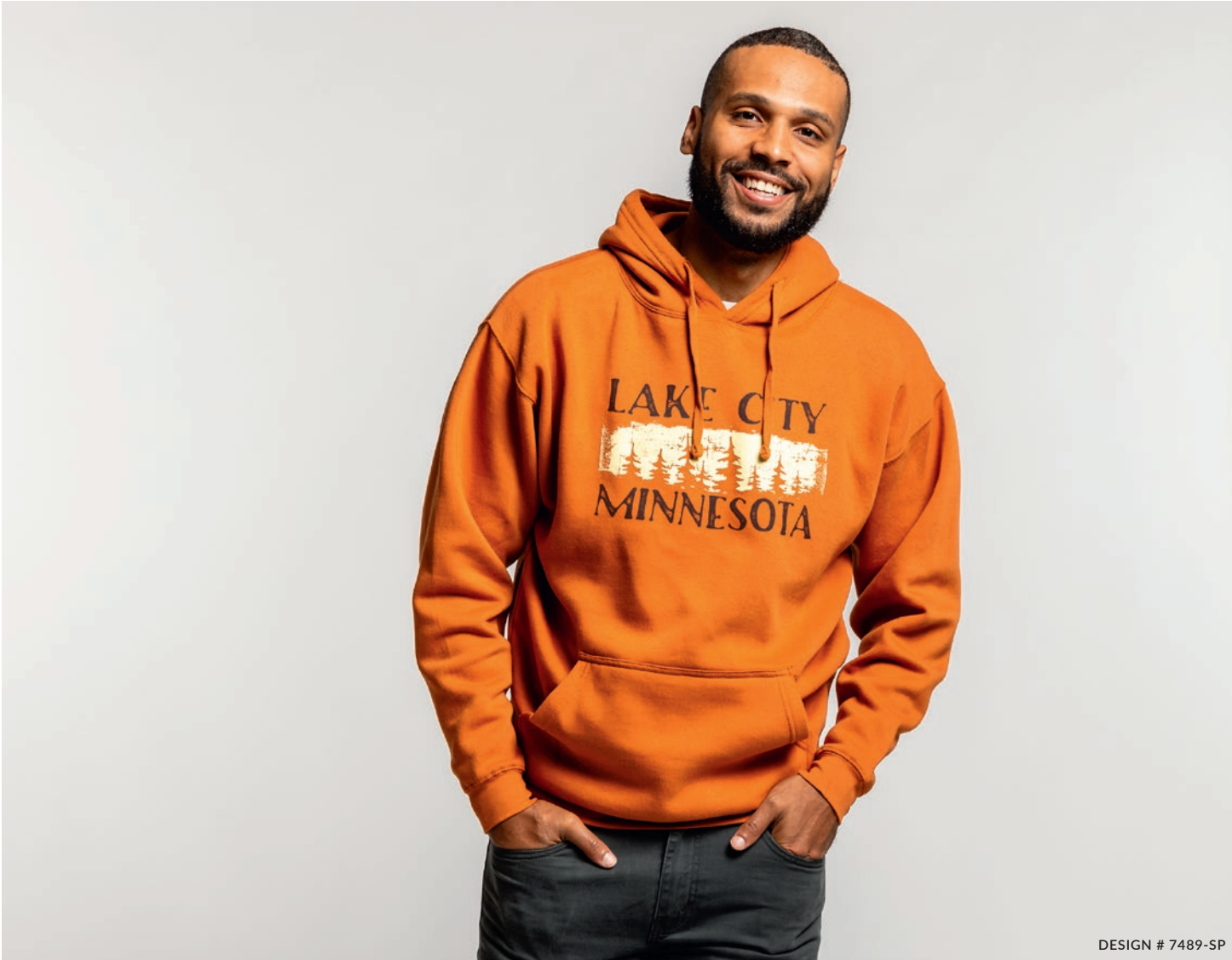
DESIGN # 7489-SP