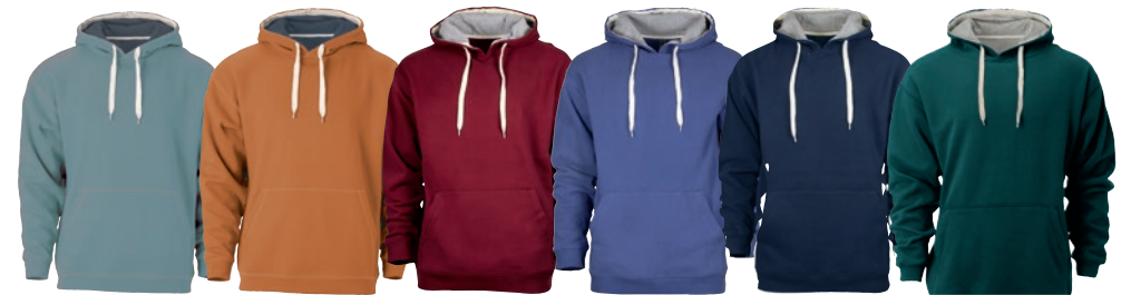
NEW HARBOR/OMBRE BLUE ADOBE/ OMBRE BLUE OXBLOOD/ PREMIUM HEATHER INDIGO/PREMIUM HEATHER NAVY/ PREMIUM HEATHER DARK SEA/PREMIUM HEATHER

Nuvola® Plus Sueded Hood. Generously cut, contrast jersey-lined, 3-panel hood. Sueded & brushed fleece delivers a cloud-like feel for ultimate luxury. Gusset construction at underarms for better fit & mobility. Standard kangaroo pocket. Available in S-XXL.