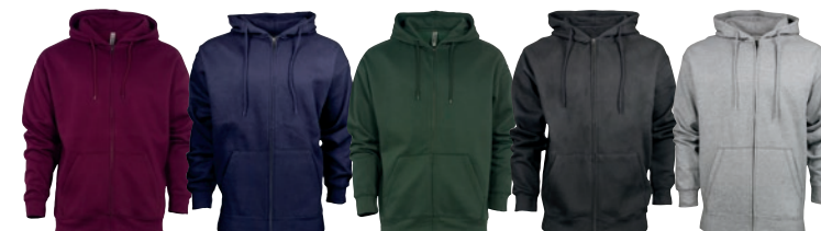
MAROON NAVY ATHLETIC HUNTER BLACK PREMIUM HEATHER

Durable and solid construction with a specialty wash for extra softness. Brushed interior for ultimate comfort. Double layer of fleece in the hood. Perfect fabric for all decoration techniques. Extra deep pouch pocket. Covered zipper for a clean, polished finish. Available in XS-XXL.