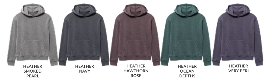
HEATHER SMOKED PEARL

57% Cotton / 43% Polyester, 220gsm/8oz. A must-feel, luxurious finish. Lightweight, breathable fleece, cloud like softness, brushed interior and a burnout process to give it a vintage feel. Generous hood & front pocket. Oversized for ultimate comfort. Available in S-XXL.