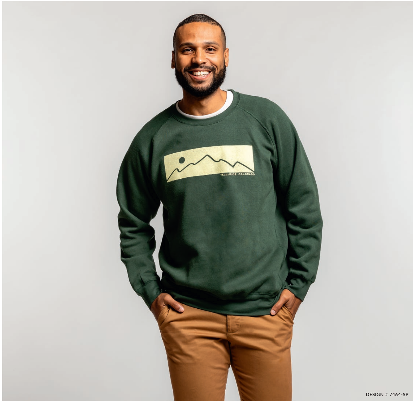
DESIGN # 7464-SP