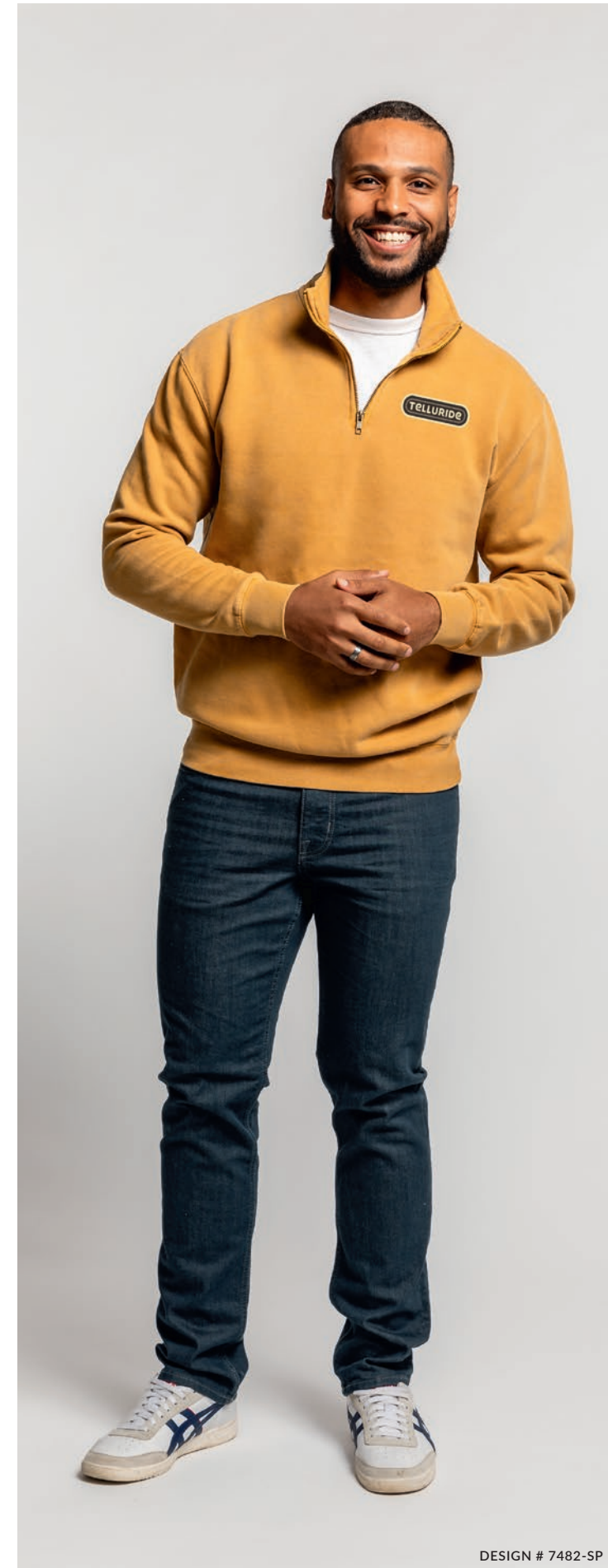
DESIGN # 7482-SP