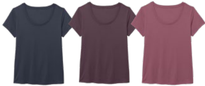
SPRING NAVY VINTAGE VIOLET HAWTHORN ROSE