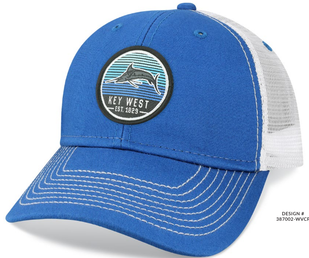
DESIGN # 387002-WVCP