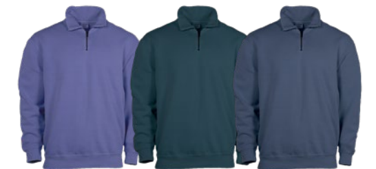
NEW PERI NEW DARK SEA WASHED NAVY

60% Cotton / 40% Polyester, Ring Spun, Pigment Dyed Fleece, 305gsm/9oz. Garment dyed with a pigment wash for a worn-in look. Relaxed collar with exposed, antique brass zipper. Available in S-XXL.