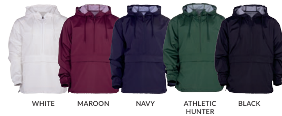
WHITE MAROON NAVY ATHLETIC HUNTER BLACK

Water resistant fabric with Durable Water Repellent (DWR) finish. Generously cut, 3-panel hood. Wind resistant zippers for ultimate protection against the elements. Jacket packs neatly into front pocket for carrying convenience. Available in XS-XXL.