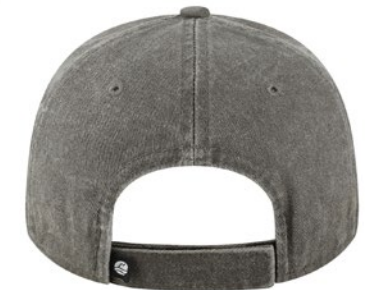
SHORT VELCRO CLOSURE

Unstructured low profile with a longer bill. 100% cotton twill cap with a pigment dyed wash. Pre-formed brim. 360 Pro-Stitch for a clean, classic look. Short velcro closure.