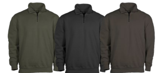
EVERGLADE WASHED BLACK CHESTNUT