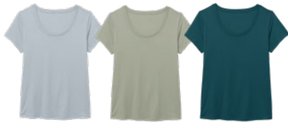
BLUE FOG DESERT SAGE OCEAN DEPTHS