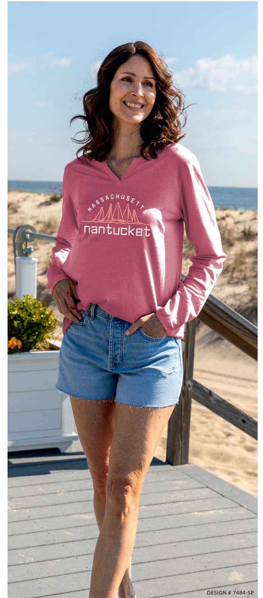
DESIGN # 7484-SP