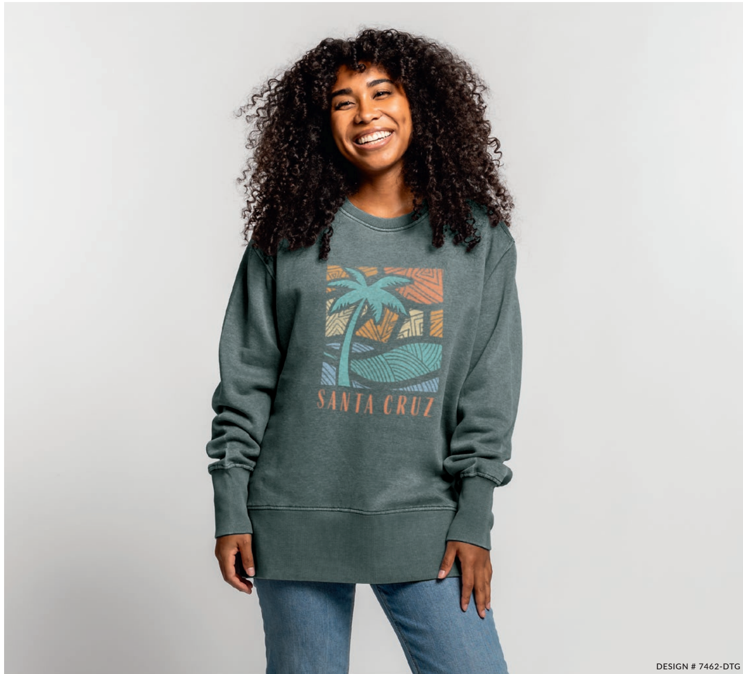
DESIGN # 7462-DTG