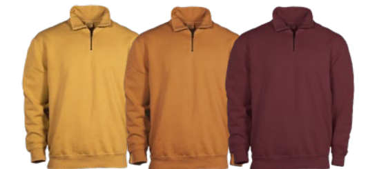
AUTUMN BLAZE ADOBE SYRAH