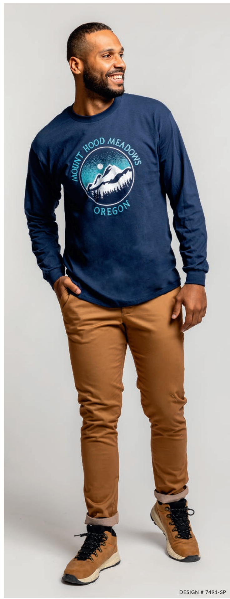
DESIGN # 7491-SP