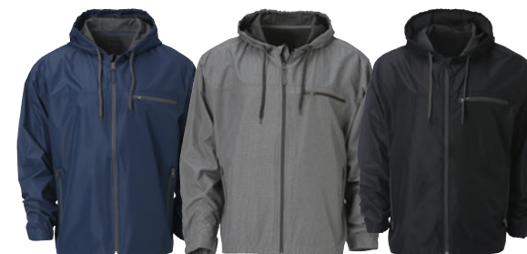
DEPTH CHARCOAL HEATHER BLACK

100% Polyester, 66gsm/1.9oz. Charcoal Heather is 72 gsm/2.1oz. Water resistant fabric with Durable Water Repellent (DWR) finish. Generously cut, 3-panel hood. Wind resistant zippers for ultimate protection against the elements. Mesh-lined hood and back yoke for better moisture management. Jacket packs neatly into left hand pocket for carrying convenience. Available in S-XXL.