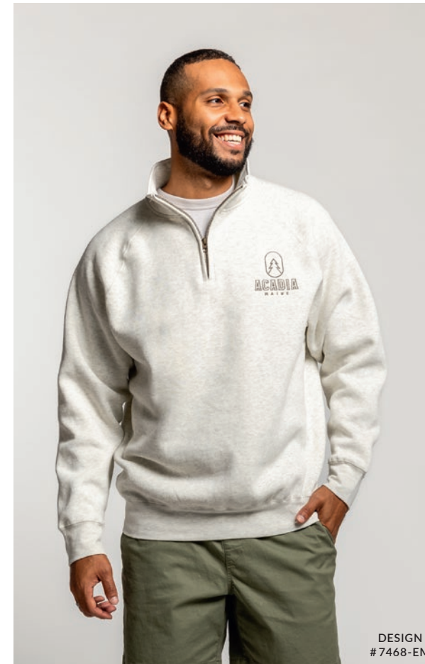
DESIGN # 7468-EM