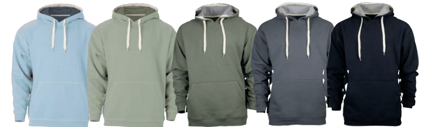
BLUE FOG/OMBRE BLUE DESERT SAGE/DEEP LICHEN MILITARY GREEN/ PREMIUM HEATHER DARK GREY/ PREMIUM HEATHER BLACK/ PREMIUM HEATHER