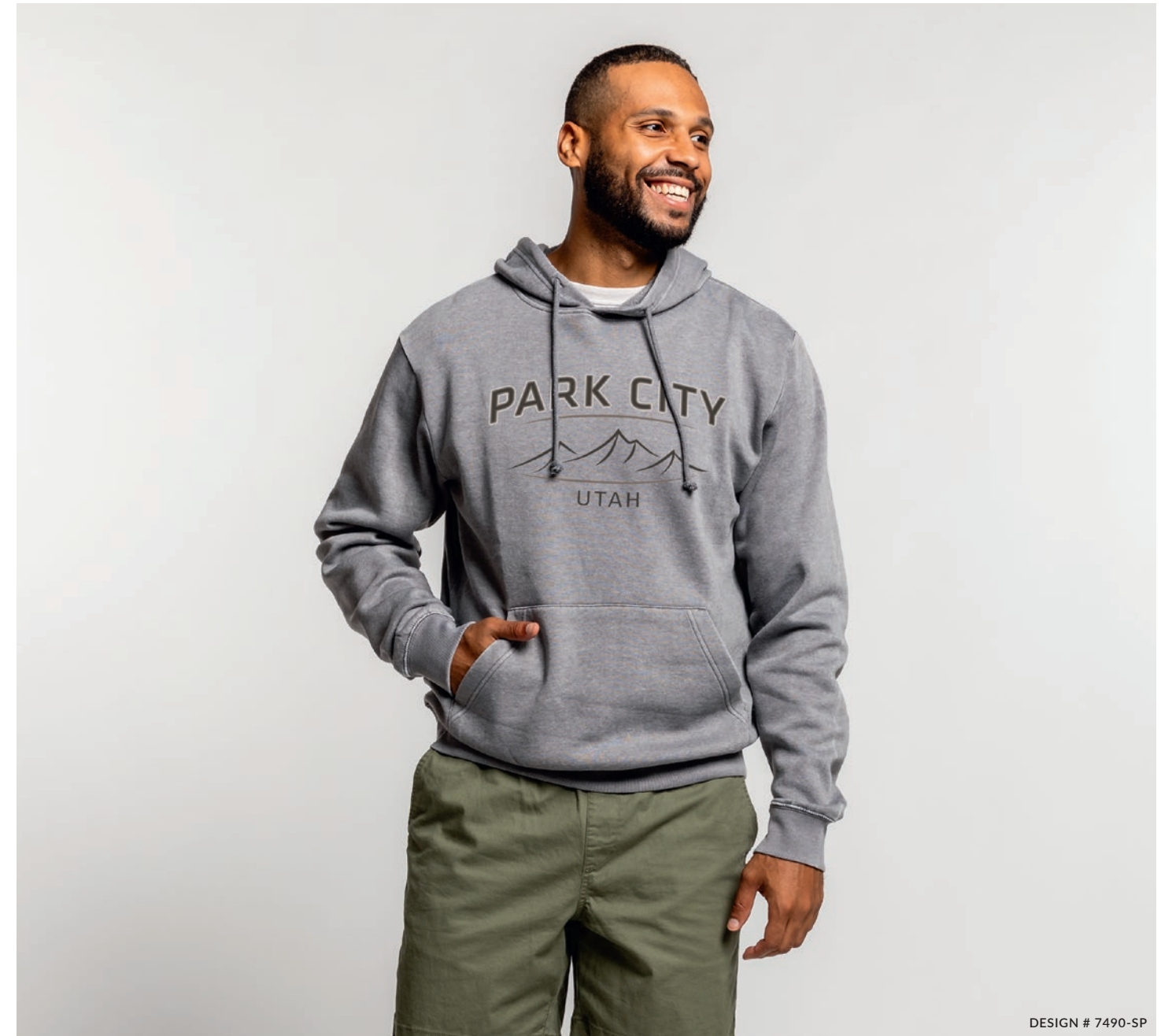
DESIGN # 7490-SP