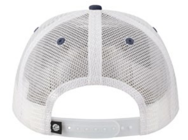
PLASTIC SNAP CLOSURE

Structured medium profile with 100% cotton twill front panels & brim. Pre-curved visor with contrast stitching, eyelets, & brim. Polyester mesh back with a plastic snap closure.