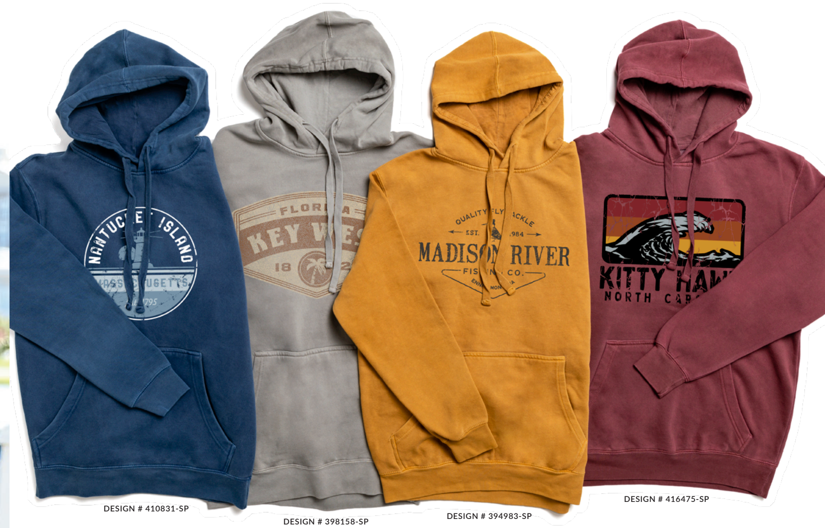
DESIGN # 410831-SP