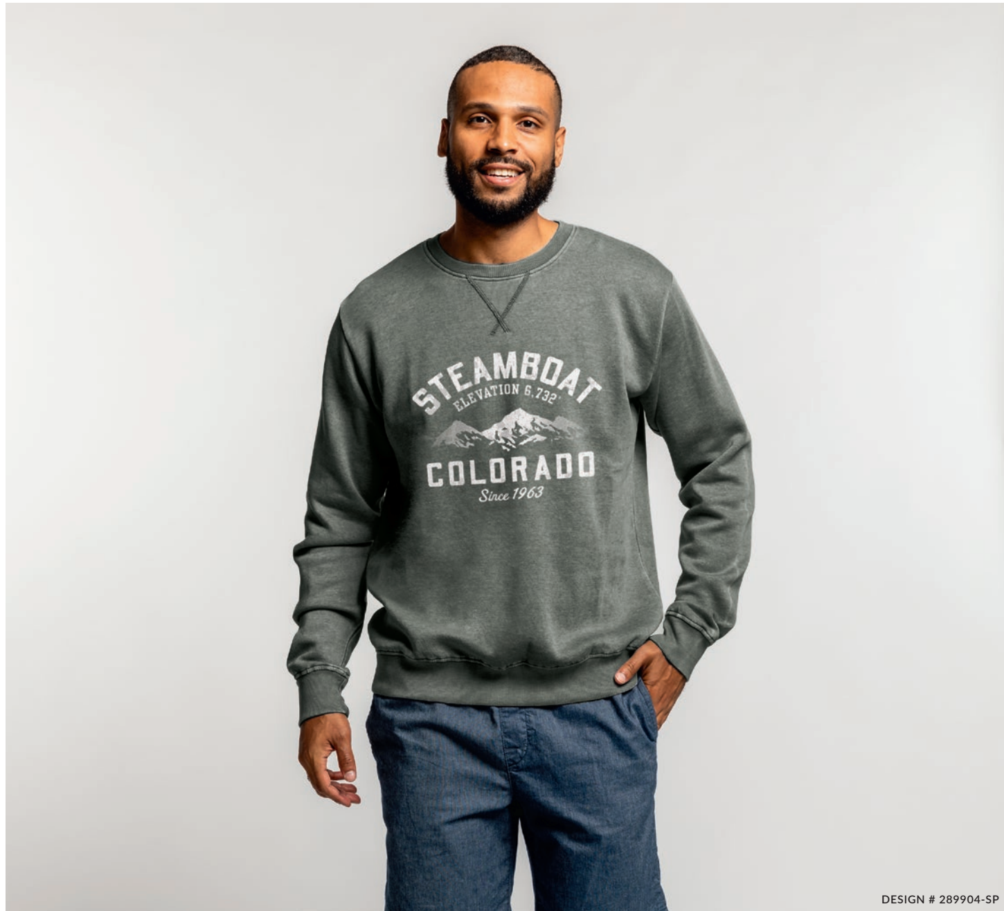
DESIGN # 289904-SP