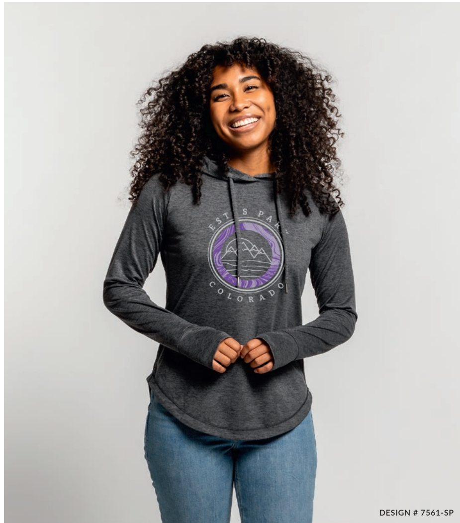
DESIGN # 7561-SP