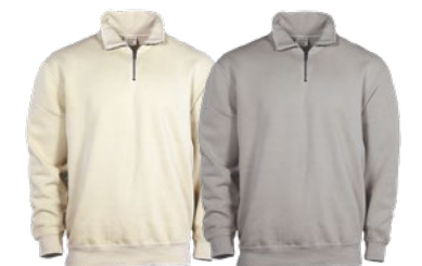
VINTAGE WHITE CEMENT