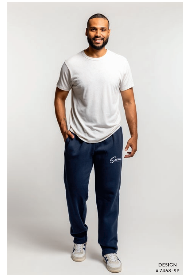
DESIGN # 7468-SP