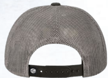
PLASTIC SNAP CLOSURE

Structured medium profile with 100% cotton twill front panels & brim. Slightly curved visor. Polyester mesh back with a plastic snap closure.