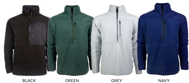
BLACK GREEN GREY NAVY

100% Brushed Polyester Fleece, 200gsm/5.9oz. Stand-up collar for protection against the elements. Half zip allows for quick temperature control. Zippered chest pocket for valuables. Available in S-XXL.