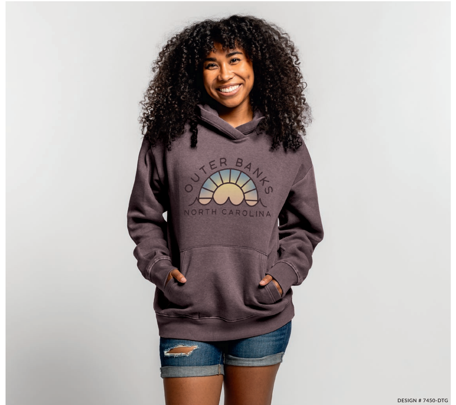
DESIGN # 7450-DTG