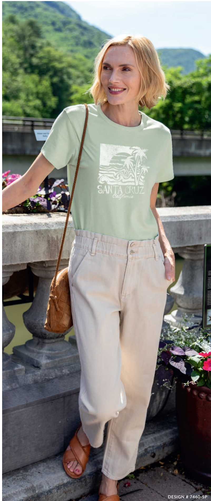
DESIGN # 7460-SP