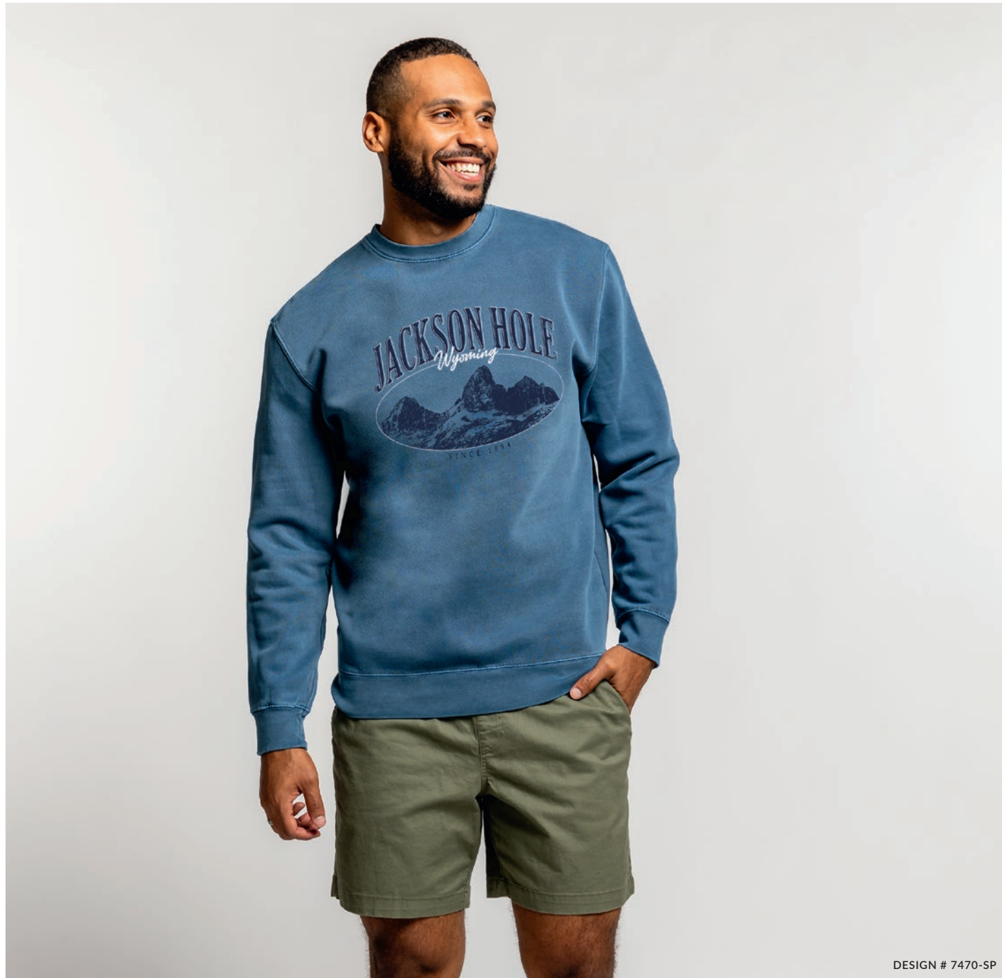
DESIGN # 7470-SP