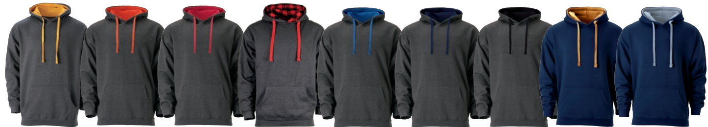
GRAPHITE/ATHLETIC GOLD GRAPHITE/ATHLETIC ORANGE GRAPHITE/RED GRAPHITE/RED PLAID GRAPHITE/ROYAL GRAPHITE/NAVY GRAPHITE/BLACK NAVY/AUTUMN BLAZE NAVY/BLUE FOG

Contrast colors in hood lining & drawcords. Durable and solid construction with a specialty wash for extra softness. Brushed interior for ultimate comfort. Double layer of fleece in the hood. Perfect fabric for all decoration techniques. Extra deep pouch pocket. Available in S-XXL.